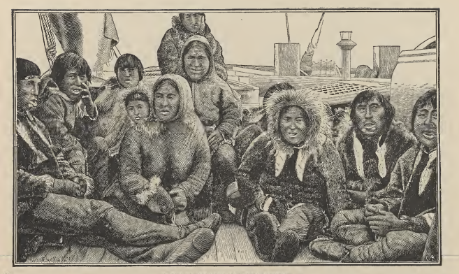
GROUP OF NATIVES AT POINT BARROW.